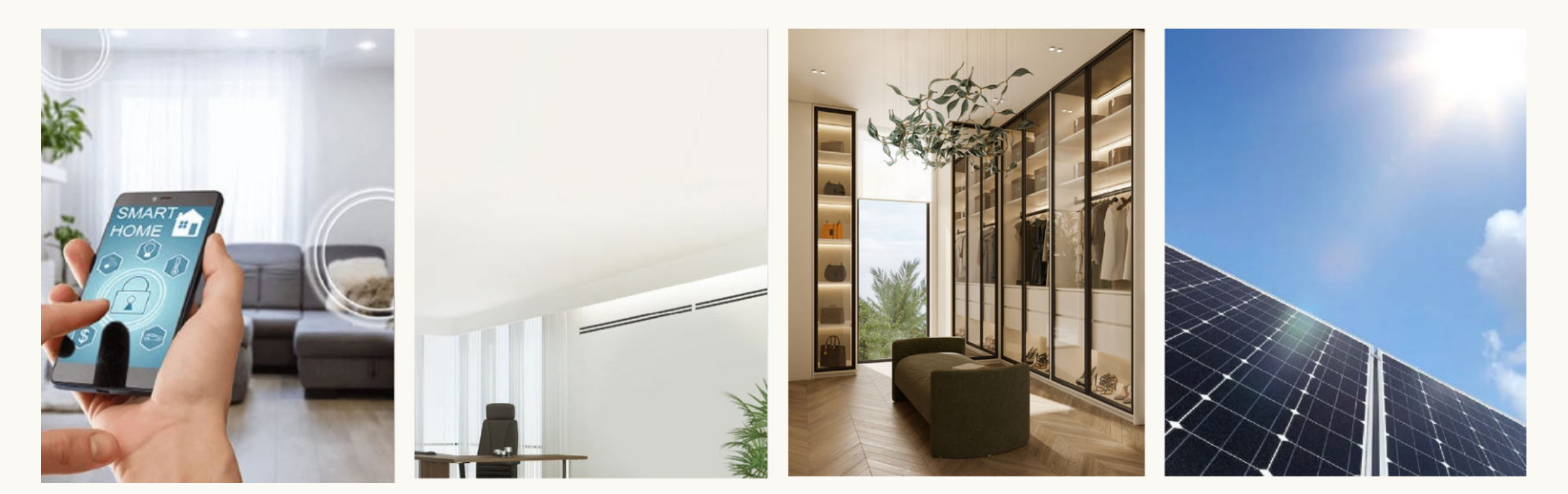
Sustainable and innovative home automation