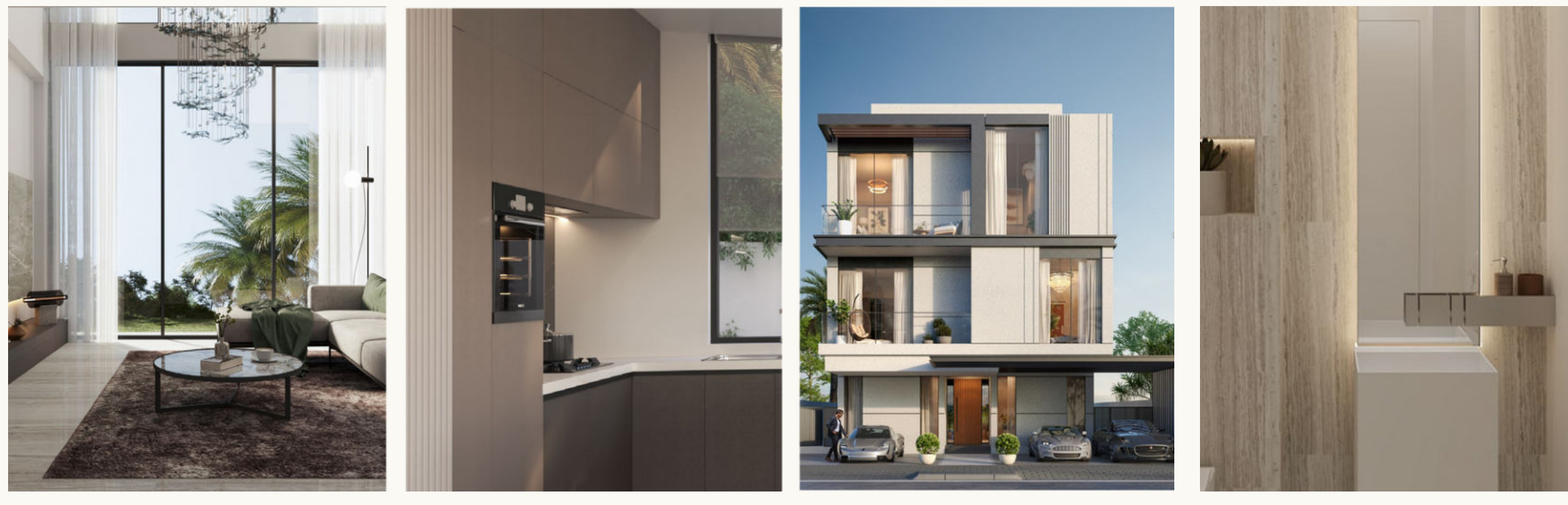
Floor to ceiling windows for internal -external connection