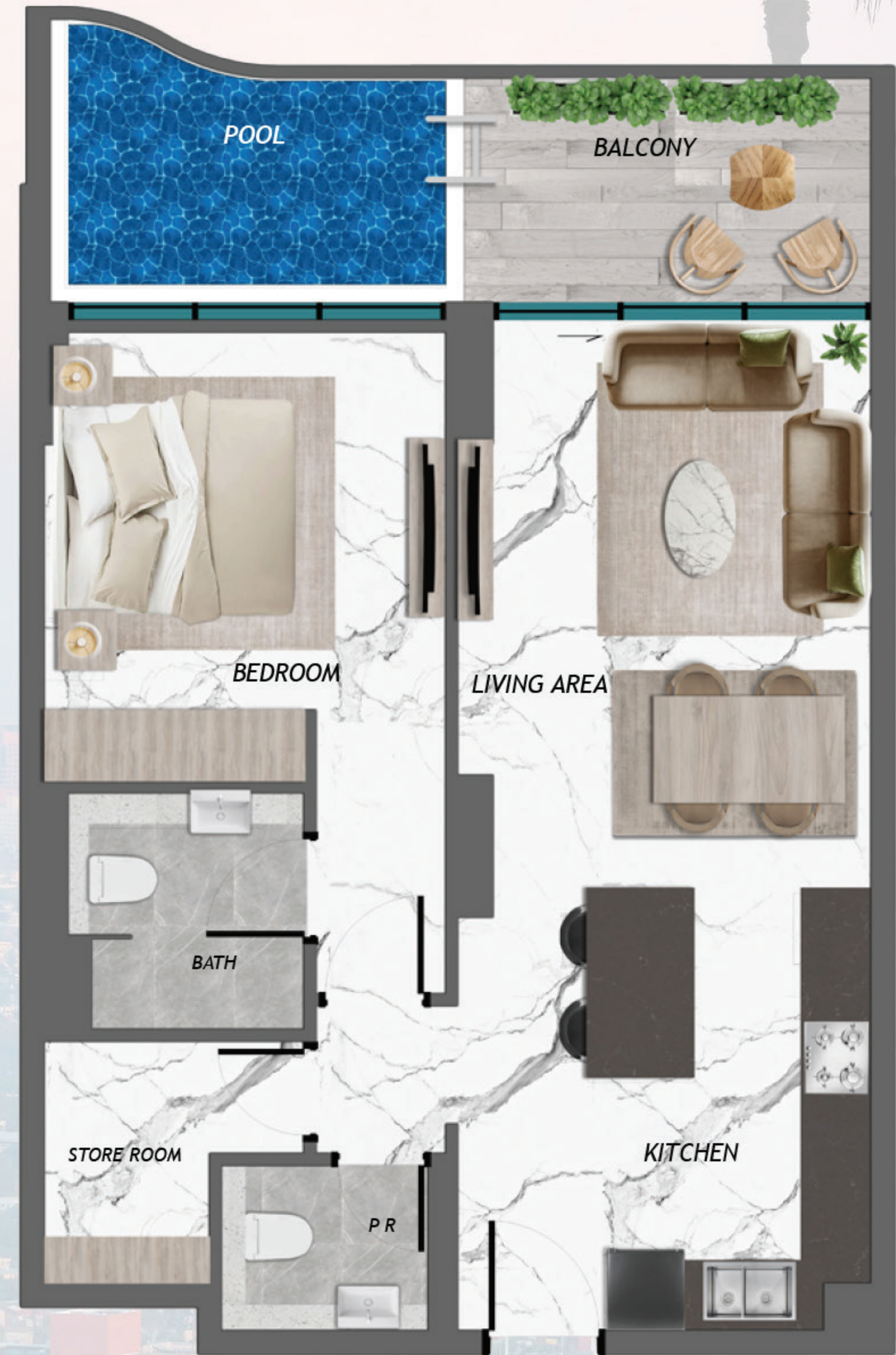
1 BR WITH POOL