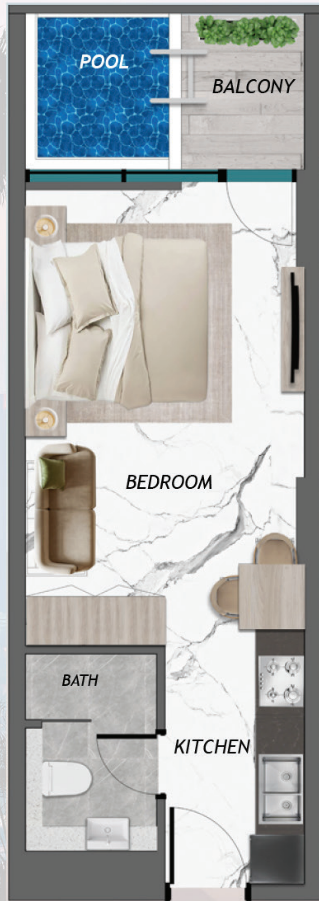
Studio WITH POOL