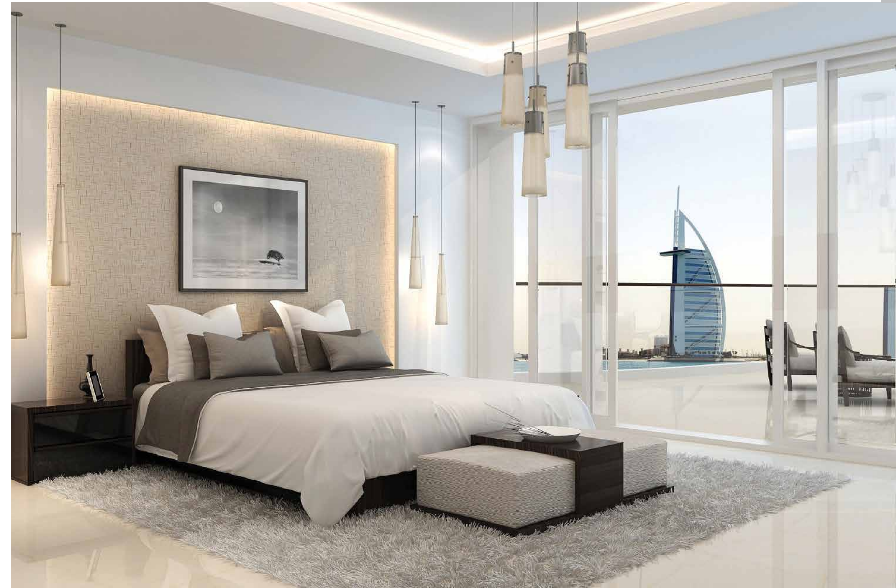
Spacious and well-designed bedrooms with floor-to-ceiling windows and large terrace provide sea view and privacy. All bedrooms are en suite.