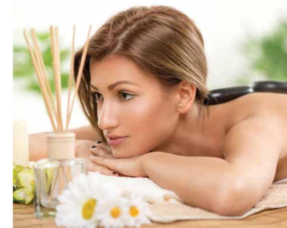
A UNIQUE PROPERTY WITH AN INTERNATIONAL RESORT AMBIANCE