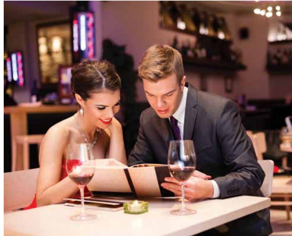
ALL THE AMENITIES OF THE MODERN LIVING WITHOUT EVER LEAVING HOME