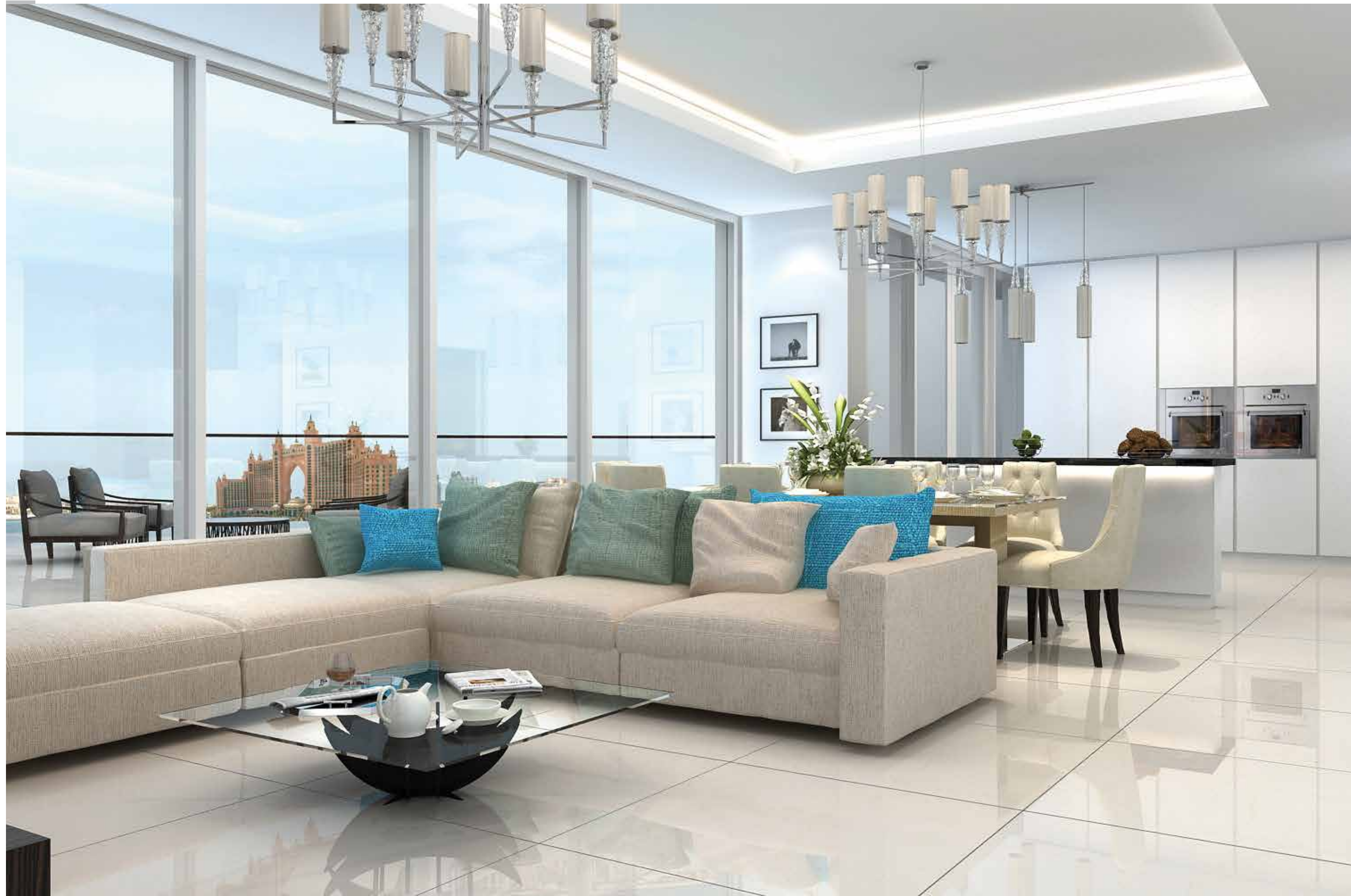
Sleek living room interiors with clean lines, neutral tones and meticulous finishes.