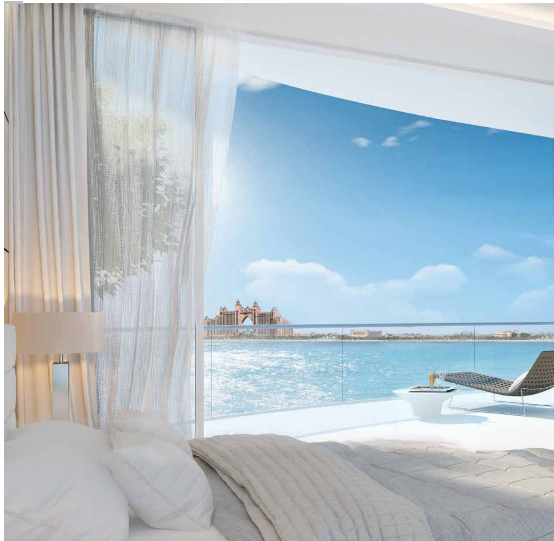
Large private terraces perfectly orientated with views of the Atlantis and the Dubai skyline.