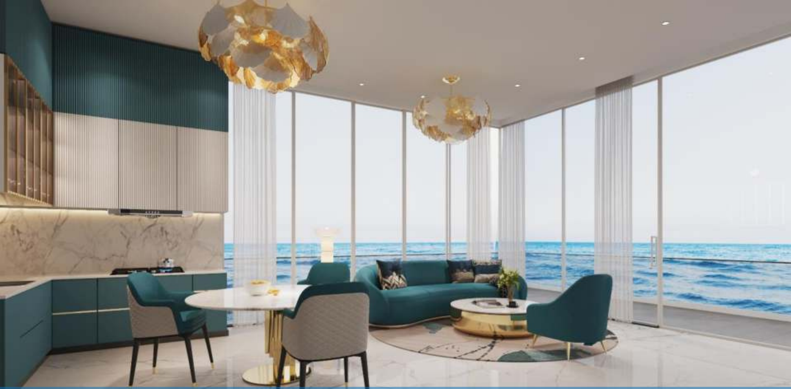
LIVING ROOM – 2 Bedroom