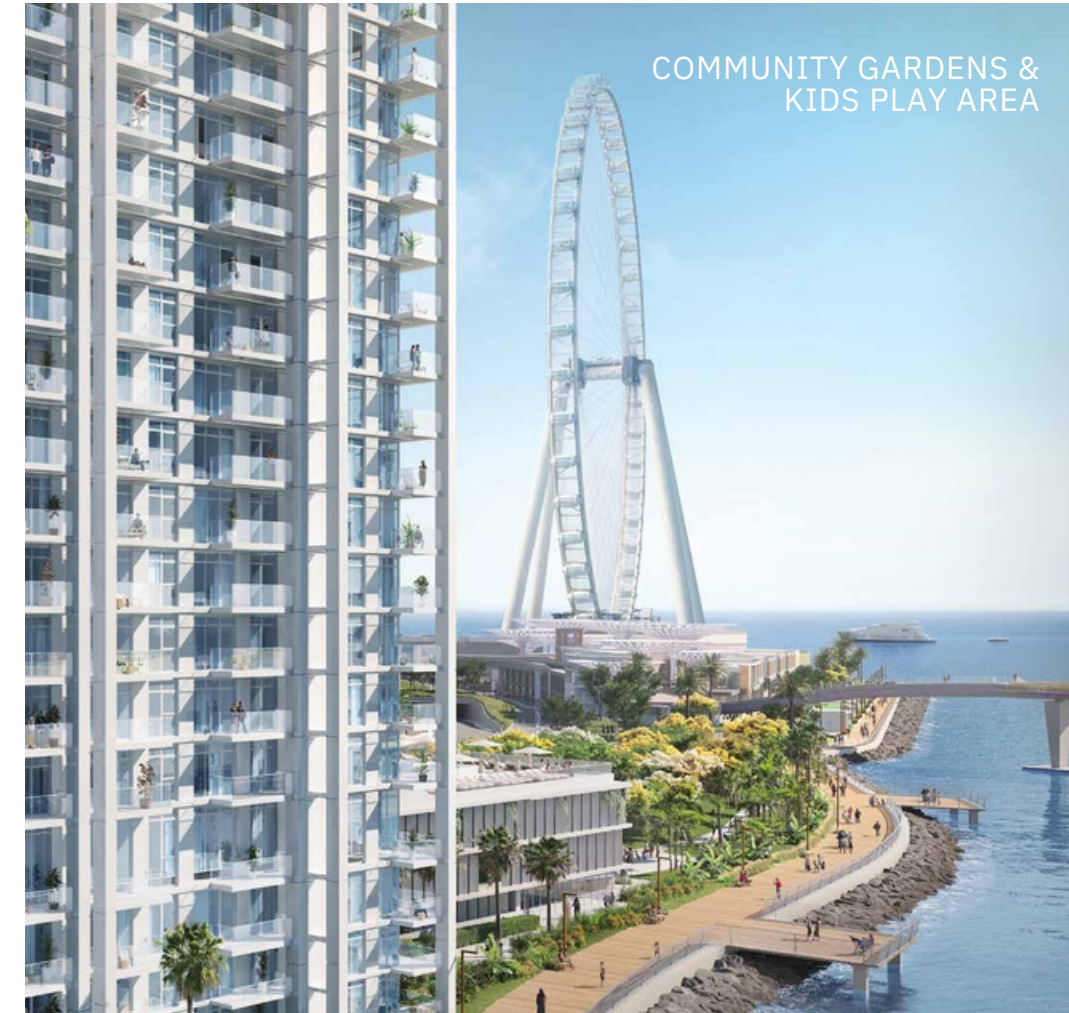
COMMUNITY GARDENS & KIDS PLAY AREA