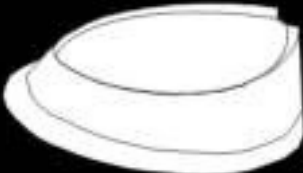
Dubai South Opera House, 2028