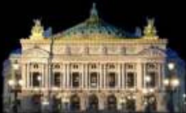
Palais Garnier, 1875