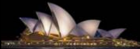
Sydney Opera House, 1973