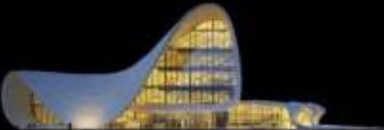
Heydar Aliyev Center, 2012