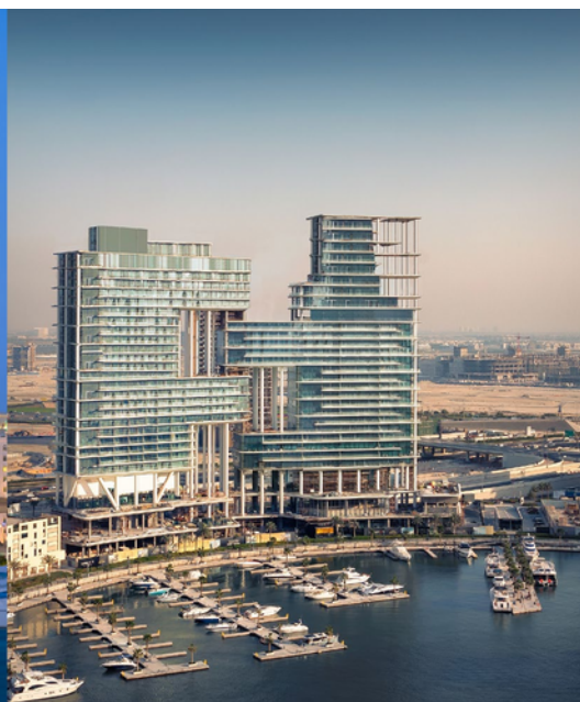
THE RESIDENCES, DORCHESTER COLLECTION, DUBAI