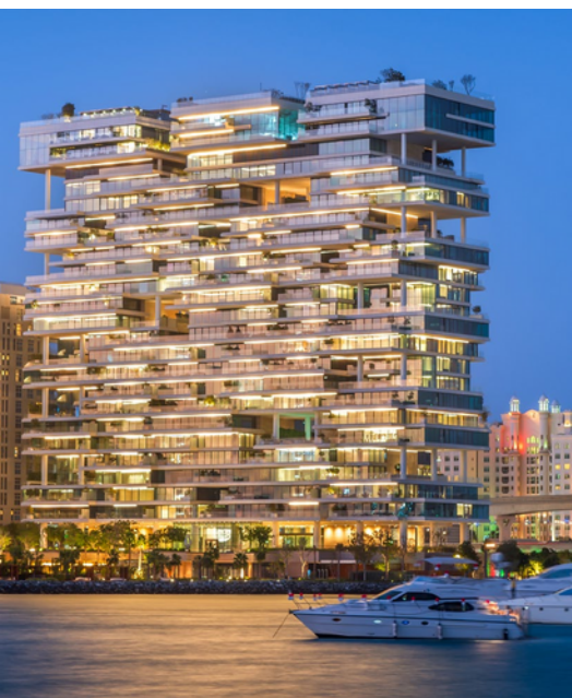
ONE AT PALM JUMEIRAH, DORCHESTER COLLECTION, DUBAI

OMNIYAT's impressive portfolio, with a combined gross realisation of over AED 17 billion, includes stars such as The Opus by OMNIYAT, One at Palm Jumeirah, Dorchester Collection, Dubai and The Residences, Dorchester Collection, Dubai.