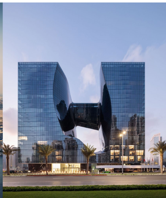
THE OPUS BY OMNIYAT, DESIGNED BY ZAHA HADID